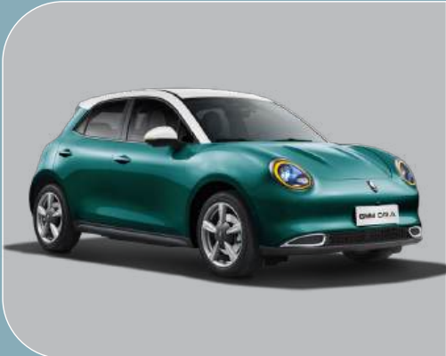
Verdant Green with White Roof