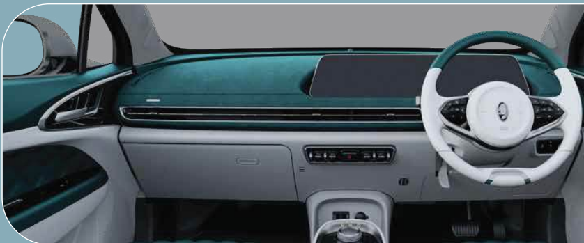
Two-Tone Interior: Green with Grey