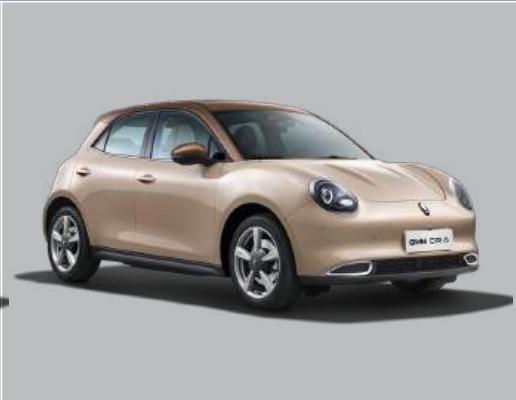
Hazel Wood Beige with Brown Roof