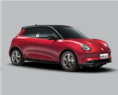
Mars Red with Black Roof