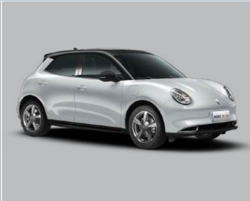
Hamilton White with Black Roof