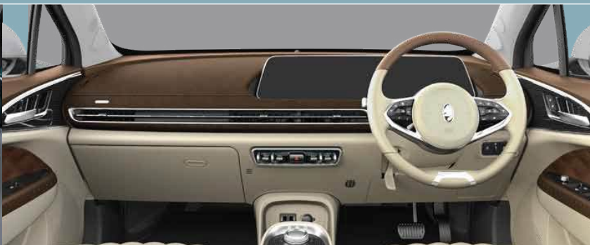
Two-Tone Interior: Beige with Brown